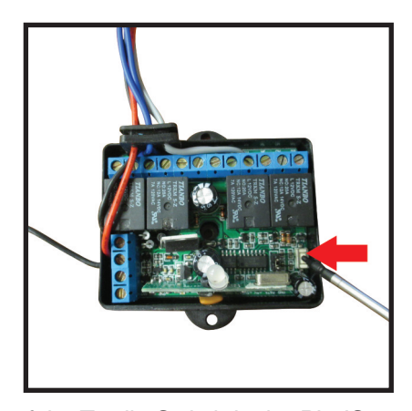
Location of the Tactile Switch in the PL-JS-181 Receiver