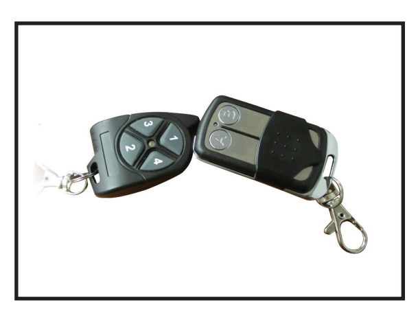
Picture shown the position of the transmitters when using transmitter PL-CRC-I11 to copy the code from transmitter PL-RC-C1